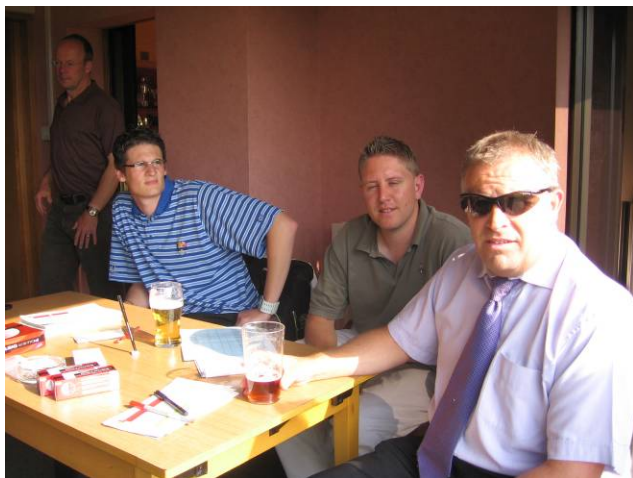
Some of the organisers relax after the event.