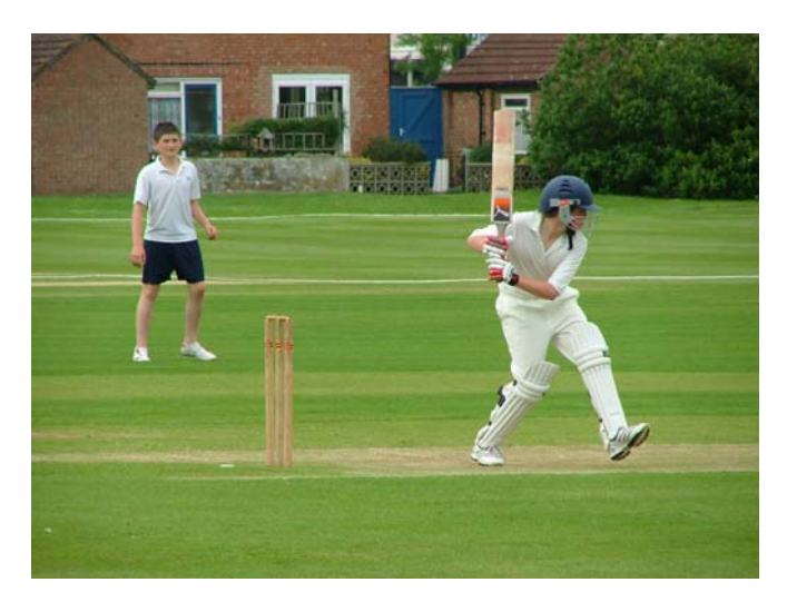
In the spotlight......