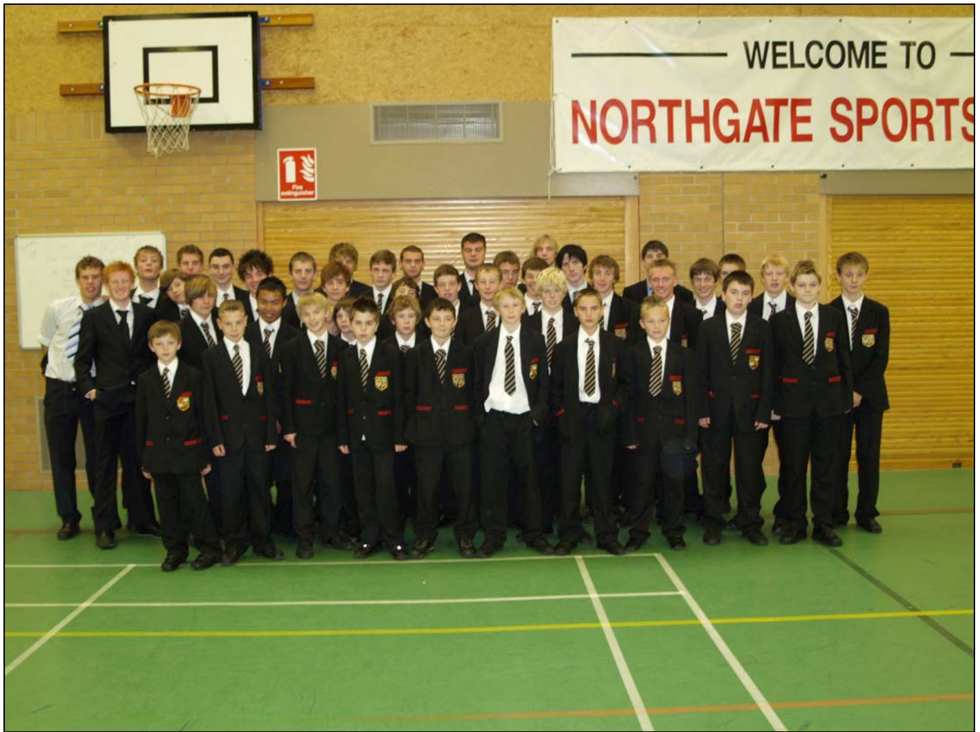
No fewer than thirty six current pupils are playing their chosen sport at County level or higher. Pictured are the boys, whos details can be found in the table below.