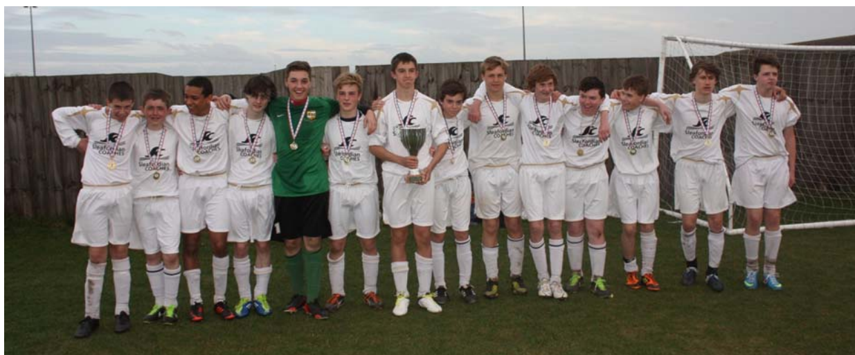
CARRE'S GRAMMAR SCHOOL UNDER 15 FOOTBALL TEAM CELEBRATE COUNTY CUP SUCCESS