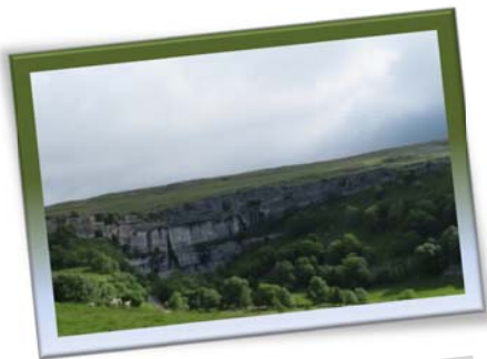
Malham Cove - Yorkshire Dales National Park