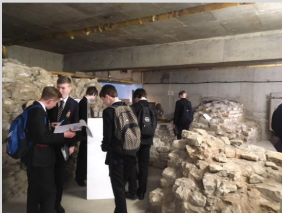
Students by the Posterngate